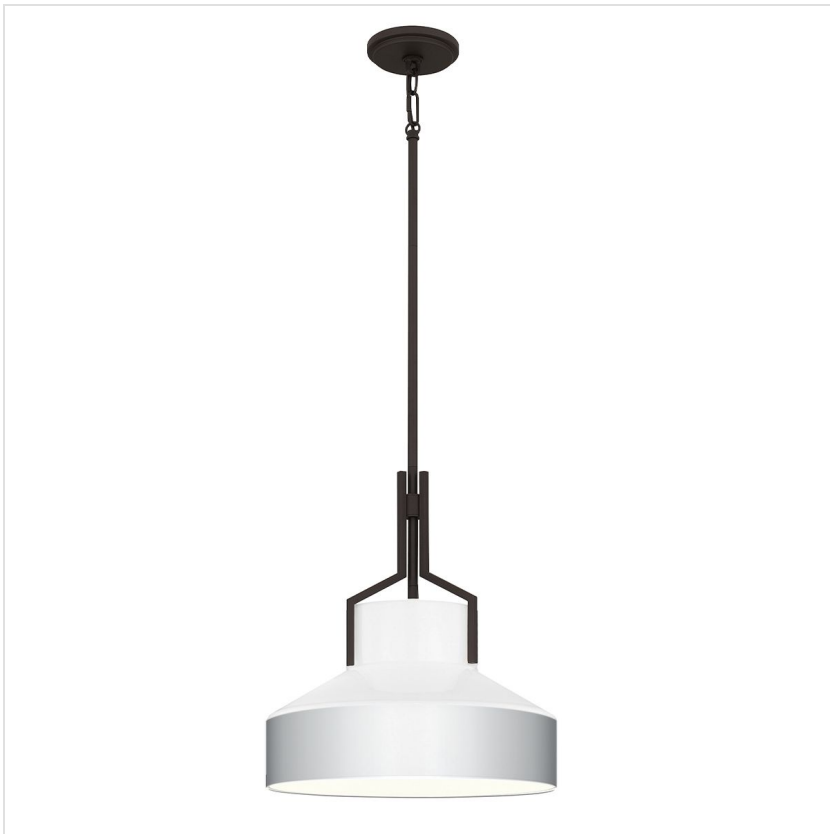
61169 2 Lt Pendant Light - Old Bronze and Cased Opal glass Shade