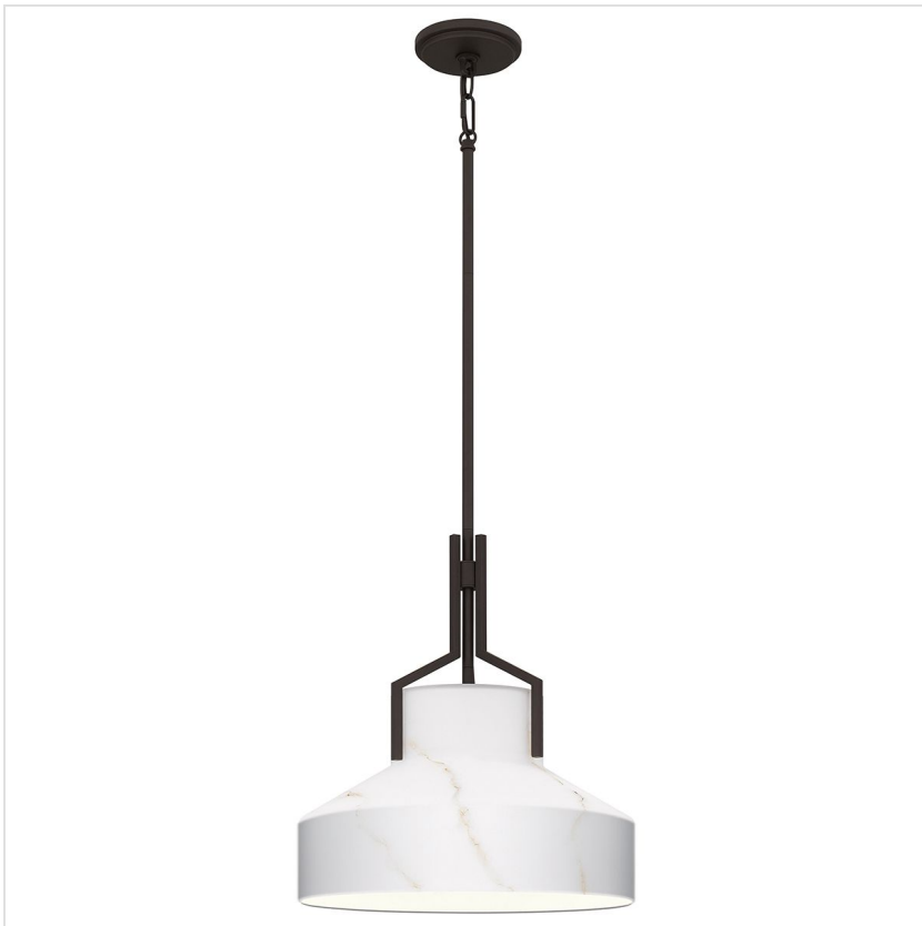
61168 2 Lt Pendant Light - Old Bronze and faux Alabaster glass Shade