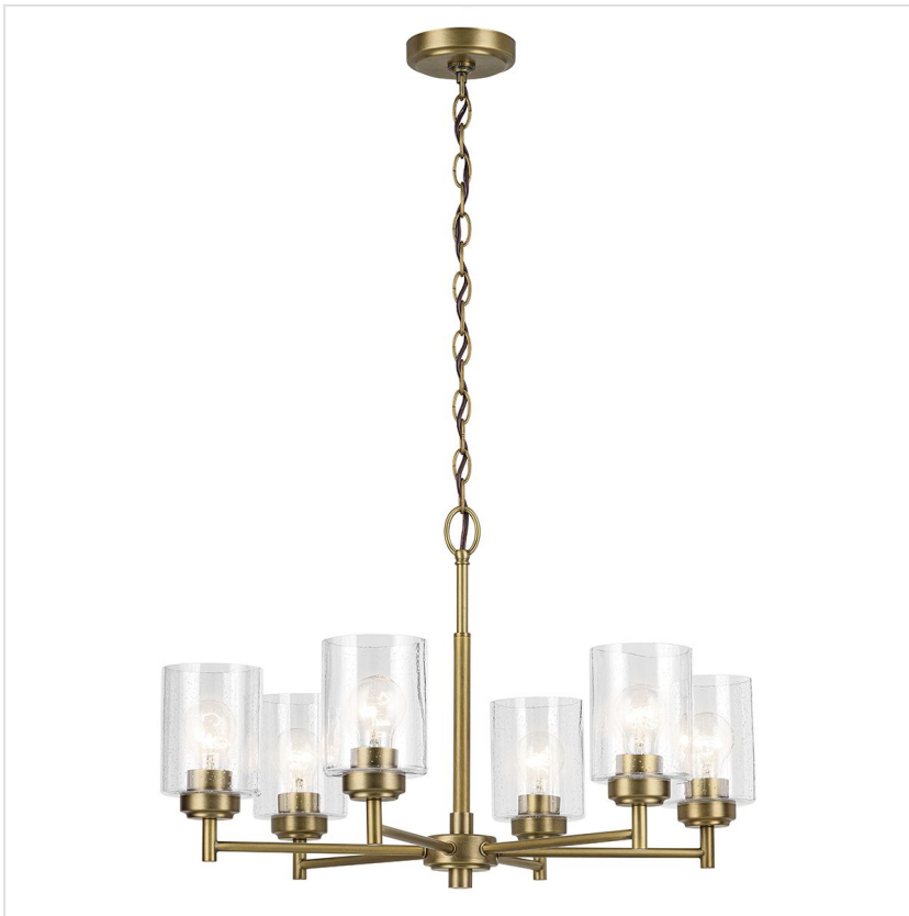
61151 6 Lt Chandelier - Natural Brass