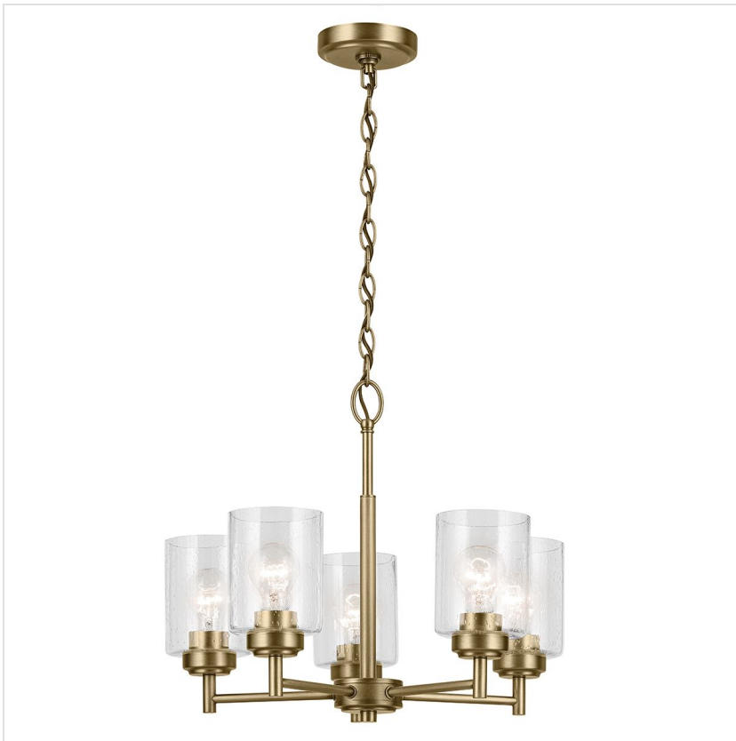
61150 5 Lt Chandelier - Natural Brass