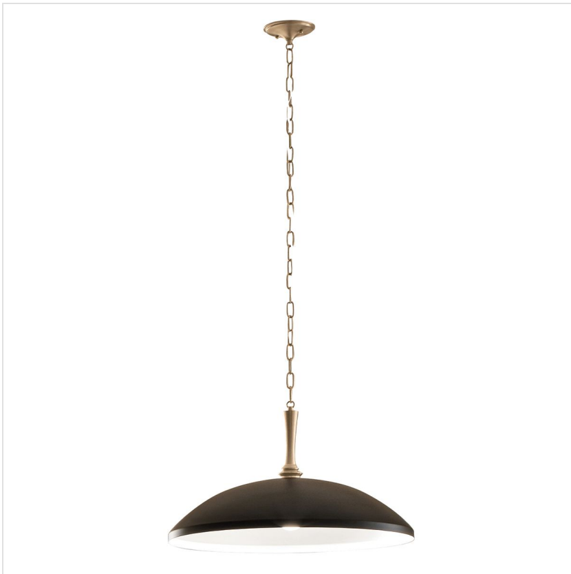
61120 1 Lt Ceiling Pendant - Black & Champagne Bronze