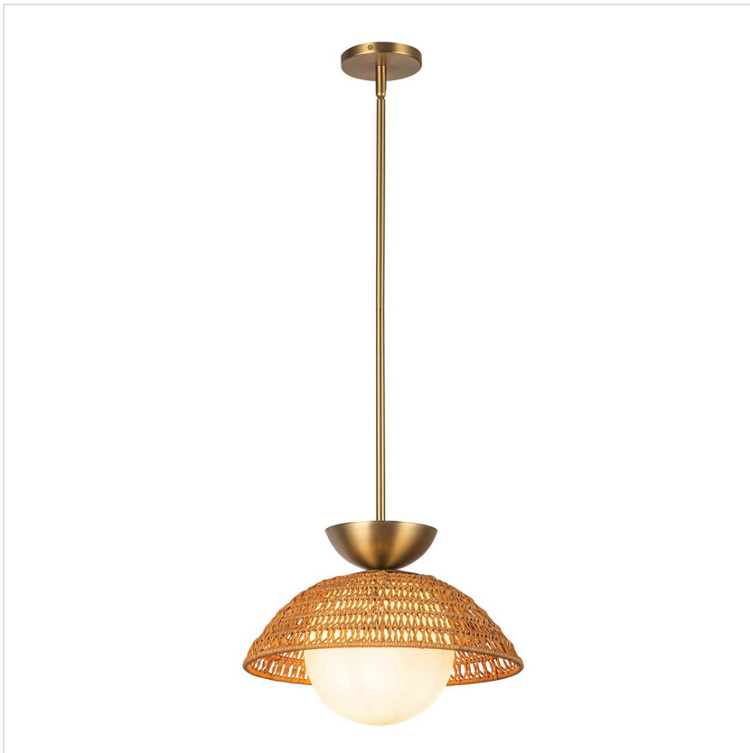
61019 1 It Pendant - Brushed Gold