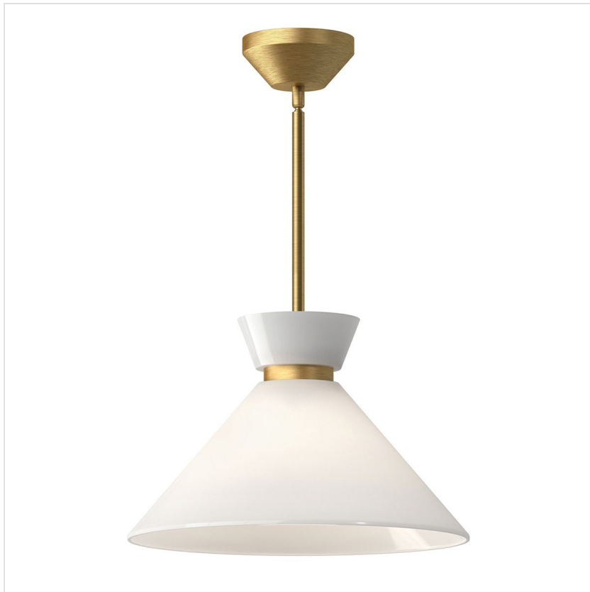
61009 1 It Pendant - Brushed Gold