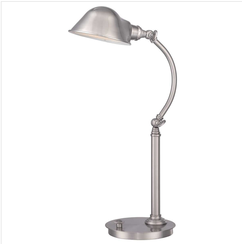
26141 LED Table Lamp - Brushed Nickel