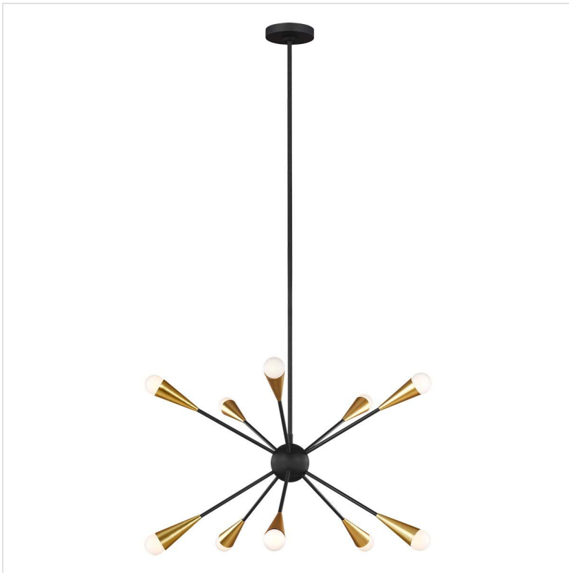
52530 10 Light Chandelier - Matte Black