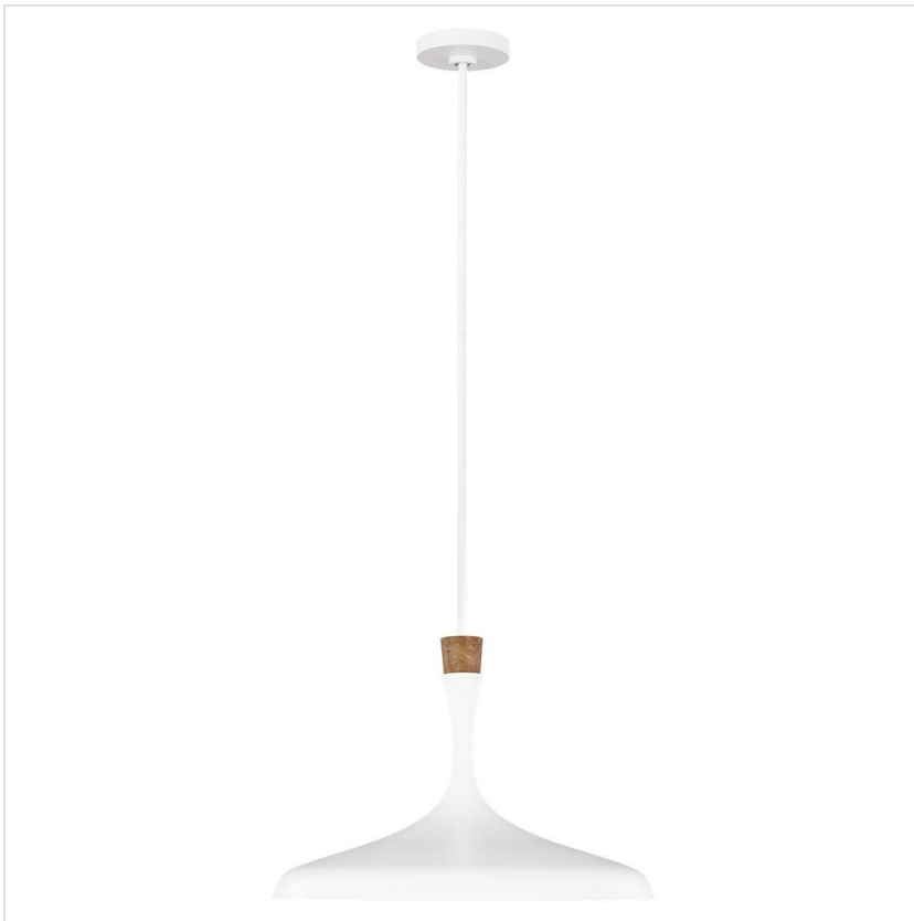
52515 1 Light Pendant - Matte White With Wood Accent