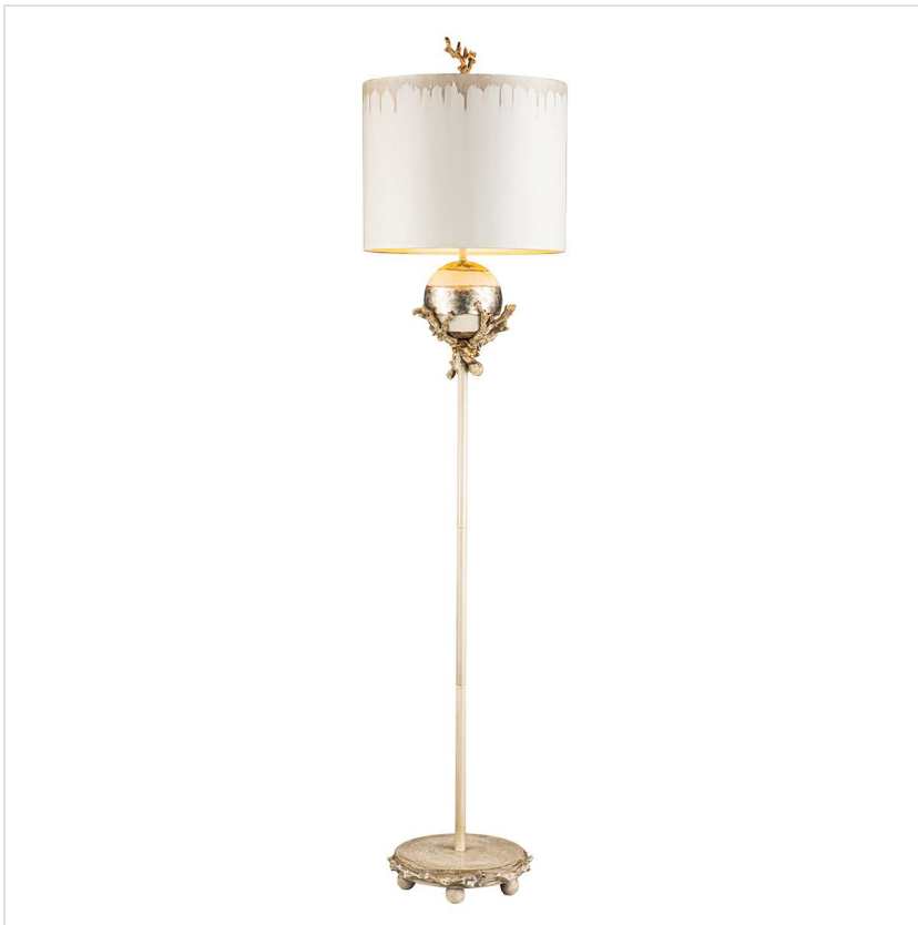
30050 1 Light Floor Lamp - Putty Patina