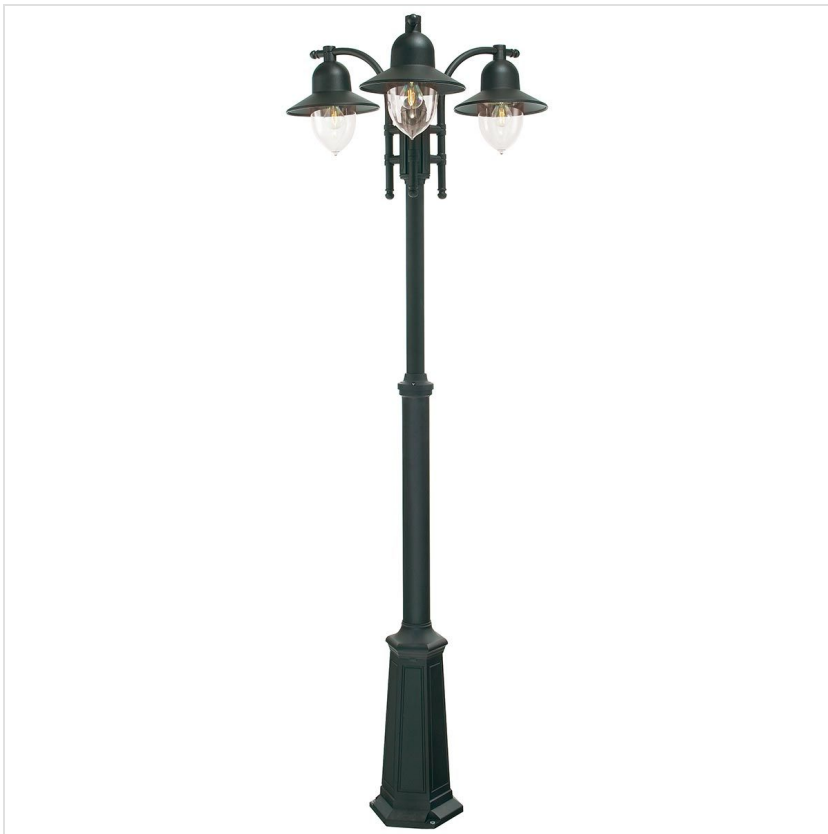
14411 3 Light Triple Head Post - Black